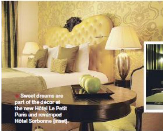
Sweet dreams are part of the décor at the new Hôtel Le Petit Paris and revamped Hôtel Sorbonne (inset).